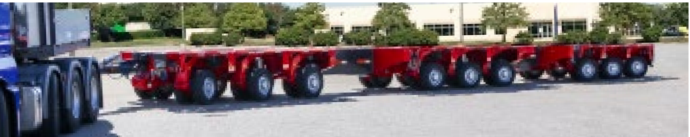
DRAWBAR COMBINATION Combination with intermediate and rear bogies for even bigger flexibility.